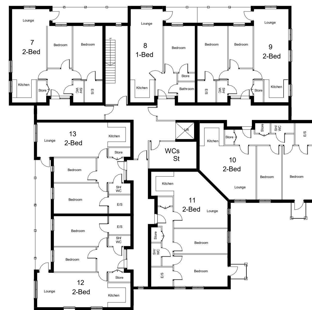
Proposed First Floor Plan 1 : 200