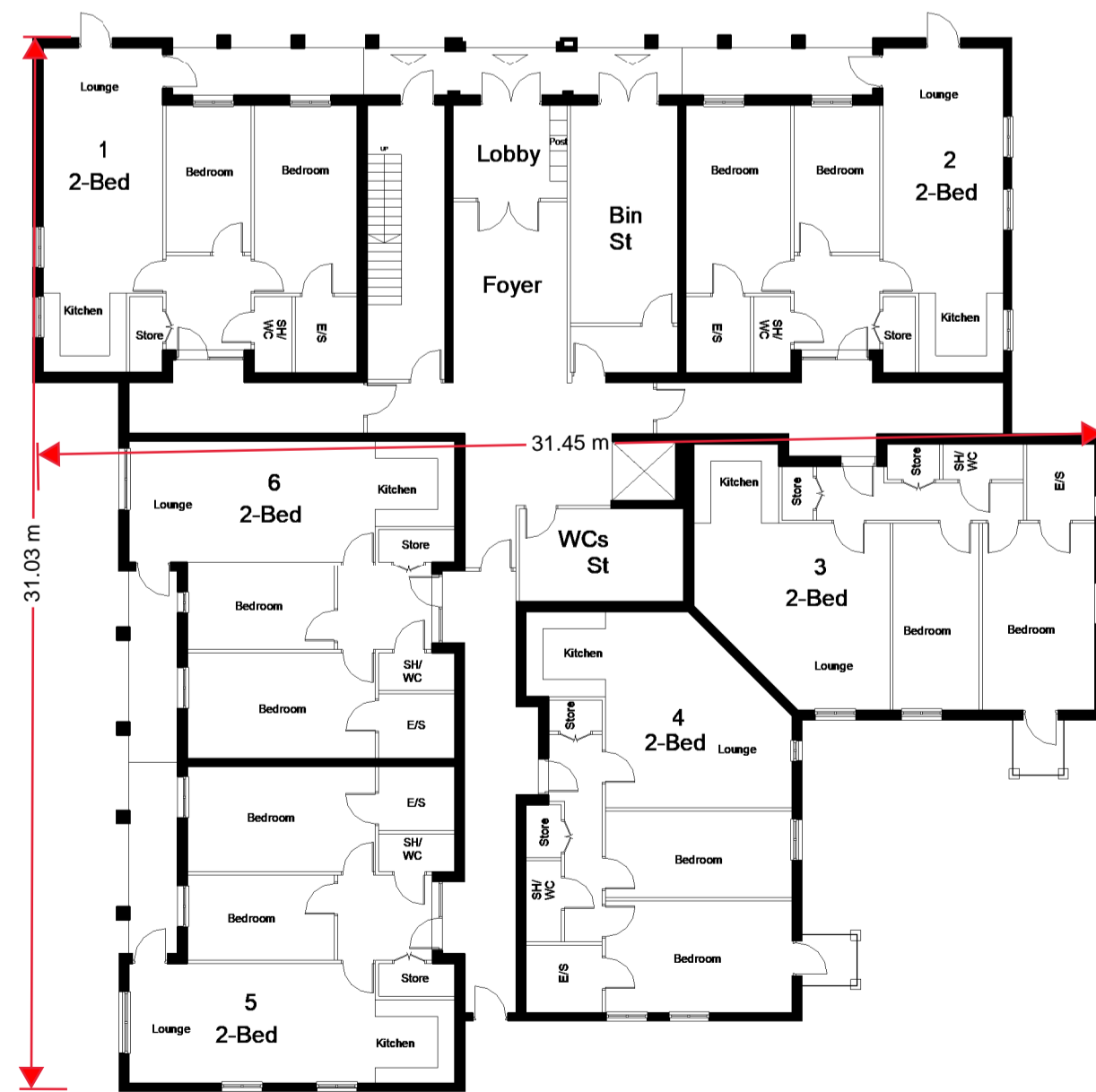
Proposed Ground Floor Plan 1 : 200