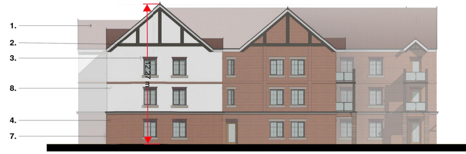
Block C - South Elevation 1 : 200