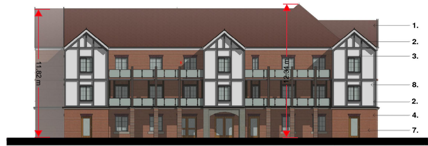
Block C - North Elevation 1 : 200