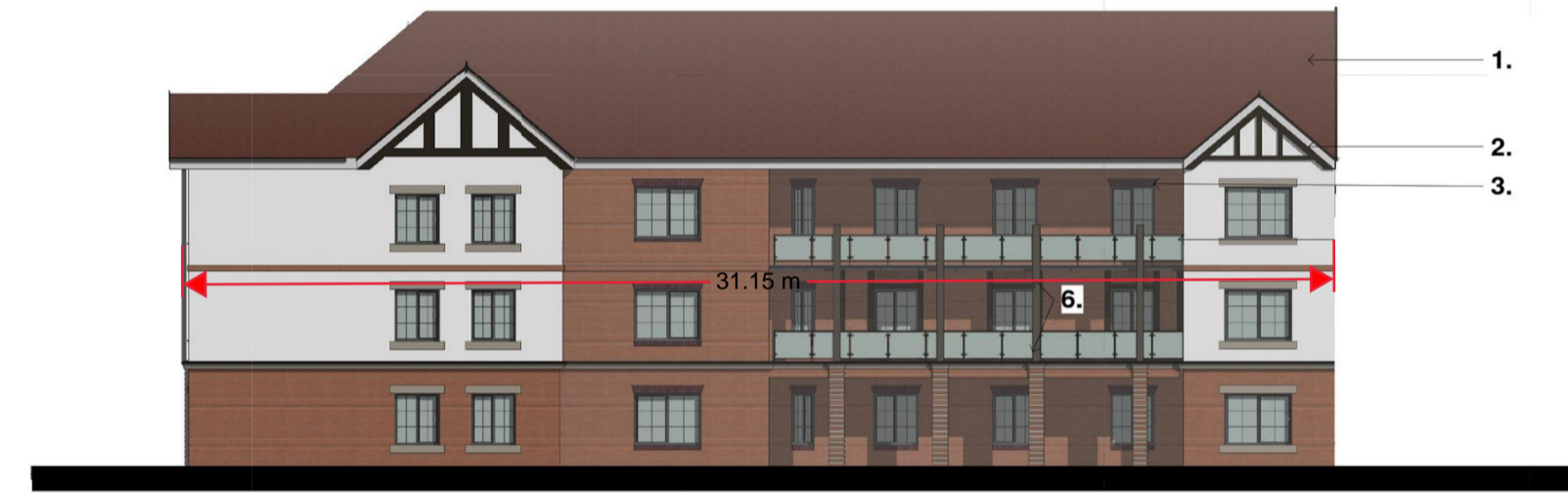
Block C - West Elevation 1 : 200

**All glazing above ground floor level on this elevation to be obscure glazed.**